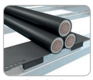
5 Place cables onto base / liner